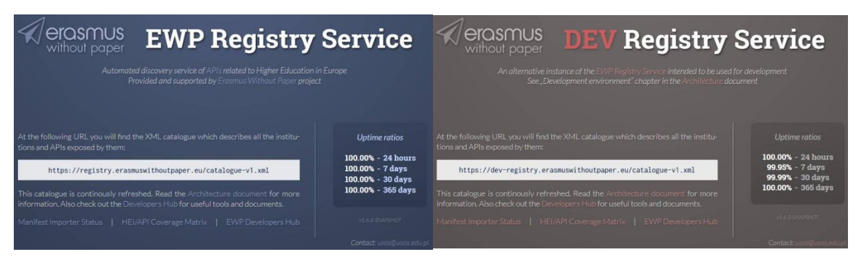
Figure 1 The PROD and DEV Registries of the EWP Network

The Registry is filled manually with the URLs of the new nodes. The Registry updates its content automatically by periodically reading Manifest files (services) located under these URLs and getting information about institutions covered and APIs implemented ( Discovery API is used for that). The Registry keeps track of all the implemented APIs in order to avoid unnecessary requests. Most changes in the Registry can be performed simply by updating the manifest on the partner's server (and the Registry will fetch these changes automatically). This approach supports the scalability of the solution.